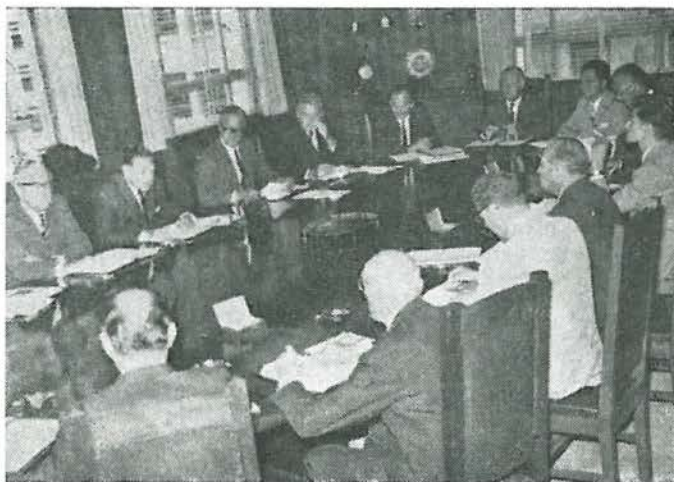
Round Table discussion in the Chamber's boardroom with members of the Cercle De L'Opinion.

Members are reminded that the contents of the Bulletin are confidential.