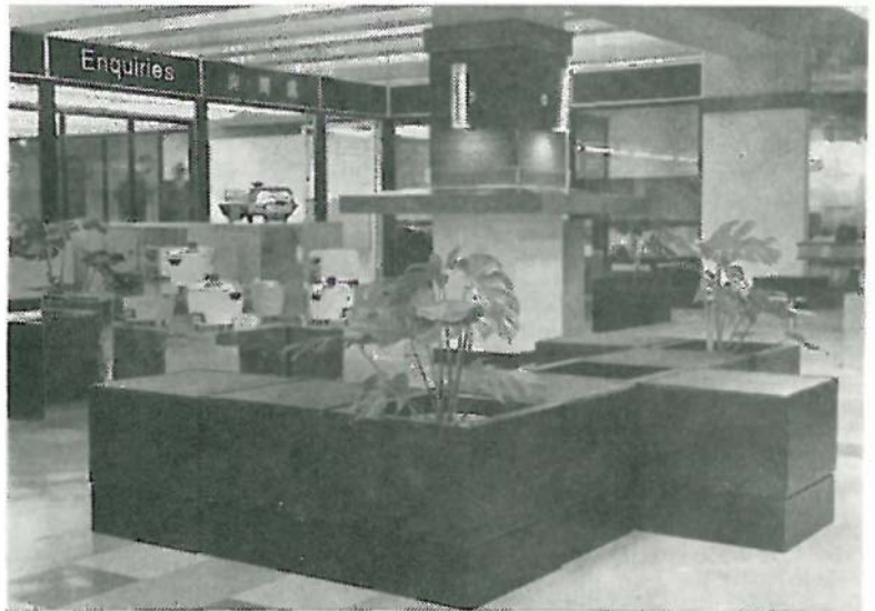
The HK Electric Co.'s Consumer Centre