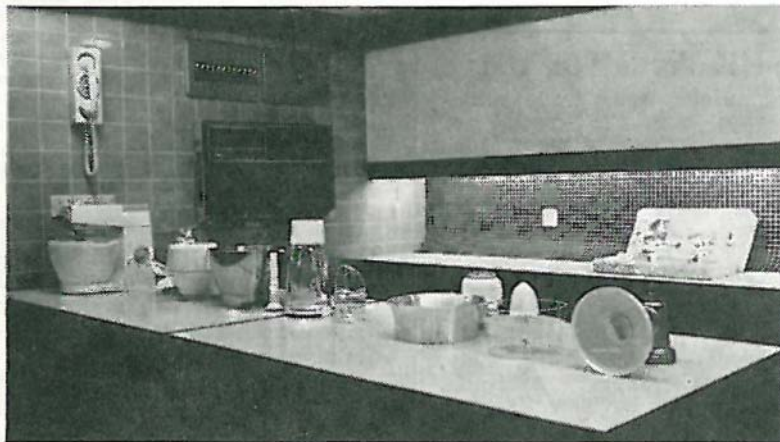
A model kitchen.

Architects, wiring contractors, as well as existing and prospective consumers may also obtain information from the company's consumer engineers on regulations governing electrical installations.