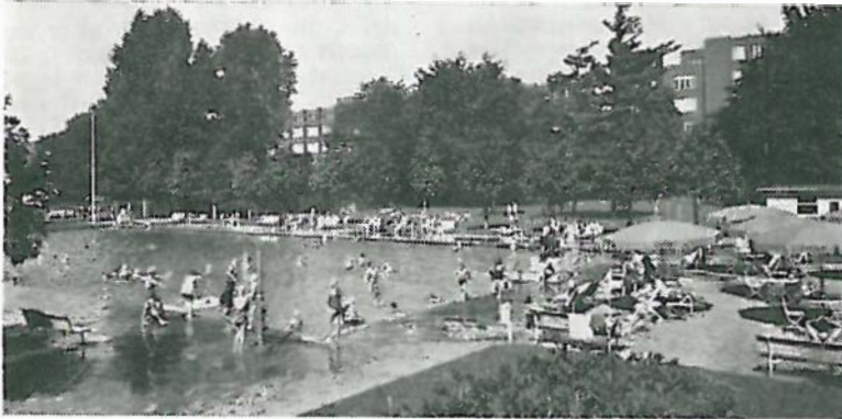
Swimming — a favourite past time everywhere.

increase. Growth of income during 1968 is likely to be limited by the increase in social security contributions, high tax rates and a lower growth rate in Government expenditure. The change-over from the 'cascade' system of turnover tax to the Tax on Value Added (T. V. A.) system on 1st January, 1968 is also expected to lead to a rise in the cost of living. The T. V. A. should theoretically cause some prices to rise, some to fall and some to remain unchanged, with narrow margins either way in almost all cases. Utilities and public transport will cost more, while food will cost less. What happens in the vast range of consumer goods will, to a great extent, depend on market conditions and on the vigilance which the Government is asking consumers to exercise.