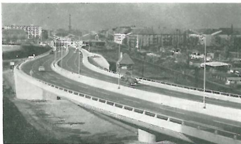
One of the modern fly-overs in Berlin.