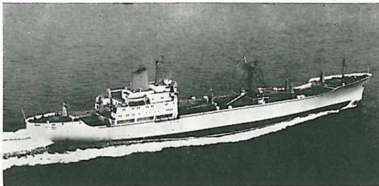
The P & O Co. announced that commencing July 19, 1968 and monthly thereafter their new 21 knot plus Strath vessels will be operating a direct London/Hong Kong cargo service via the Cape route. Hong Kong importers will have the opportunity of receiving their goods only 25 days after shipment from London. The first vessel of this fast service to Hong Kong will be the "STRATHARDLE", shown above.

The S.R.O. announced they will follow up the suggestion with "other persons and authorities who might be involved." They would also welcome comments from seamen.