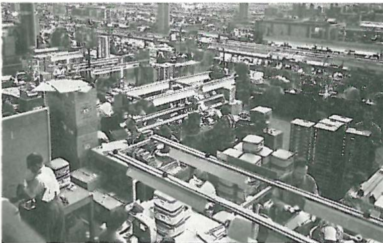
The manufacture of tape recorders.

The threatened strike by unions of the railways, the Post Office and the public services in December 1967 was averted by the settlement of a 3.5% wage