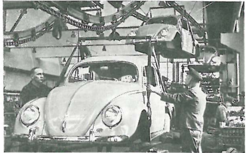
The Volkswagen, synonymous with West Germany.

Manufacturing industries account for about 88% of total industrial production, the major item breakdown being as follows: