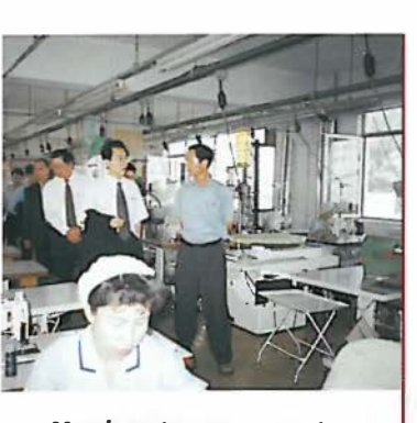
Members tour a garment factory during a mission to North Korea. 本會會員前往北韓考察期 間,造訪一家製衣廠。

Among the prestigious events organised by Chamber Services Limited in 2001 was the World Services Congress. 總商會服務有限公司於 2001年統籌的盛大活動, 包括世界服務業大會。