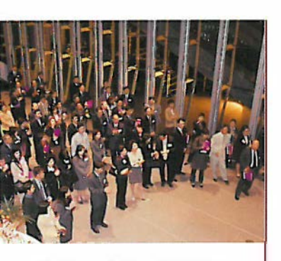
The Chamber's SME Night is very popular with members. 本會中小企之夜甚受會員 歡迎。

SME industry groups were held during the year, and consolidated in a report in December. These groups comprised: