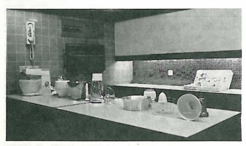
A model kitchen.

Specially trained staff fully conversant with the uses of domestic appliances will be on hand to show the various items on display ranging from air-conditioners, refrigerators and working machines, to toasters, irons and clocks.