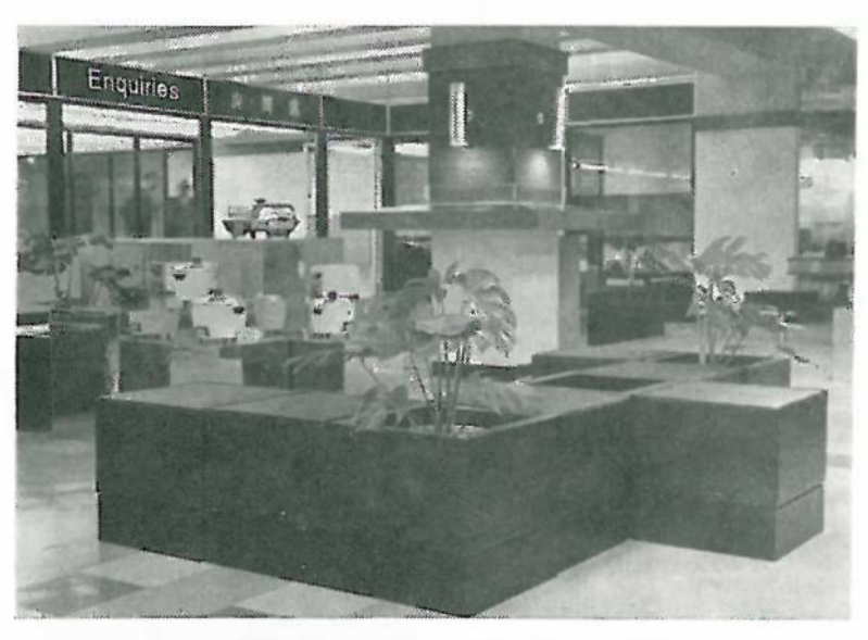
The HK Electric Co.'s Consumer Centre

Architects, wiring contractors, as well as existing and prospective consumers may also obtain information from the company's consumer engineers on regulations governing electrical installations.