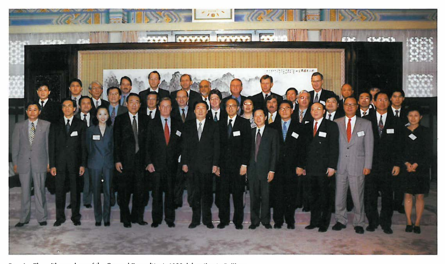
Premier Zhu with members of the General Committee's 1998 delegation to Beijing. 朱總理與1998 年理事會訪京團成員。

The outlook for the year ahead remains highly uncertain with the forecasts of private sector analysts for the local economy ranging anywhere from zero growth to a negative four