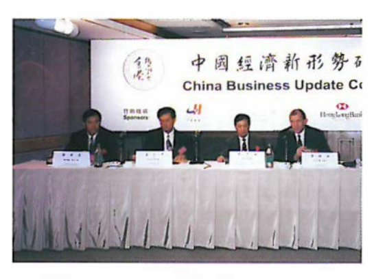
The China Business Update Conference. 中國經濟新形勢研討會

自經濟放緩後,鮑器領導的經濟政策 委員會成為該部最忙碌的委員會。委員會 定期舉行會議,商討特區經濟表現的各項 情況,並積極參與本會制定經濟政策的工 作,在編製預算案及《施政報告》建議書 方面,貢獻尤多。委員會亦忙於研究貿易 發展趨勢,並與港口管理當局及其他部門