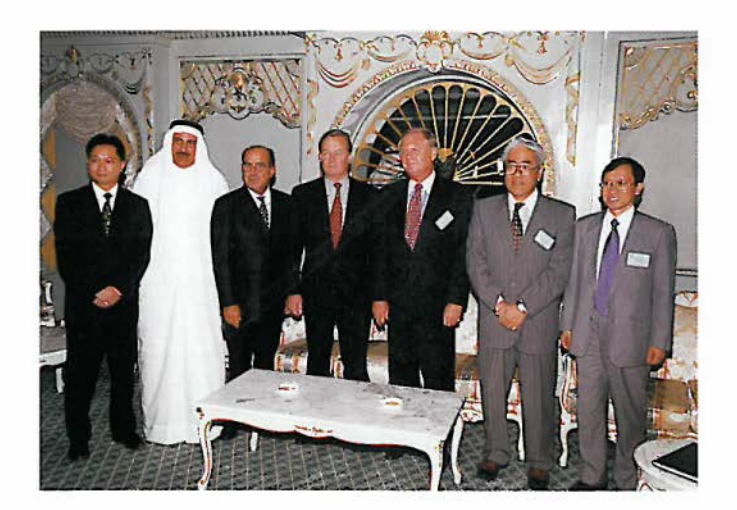
The Chamber Mission to Dubai and Bahrain. 本會出訪巴林及杜拜