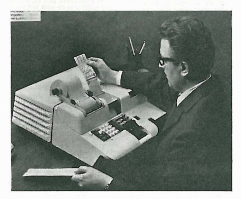
Programma 101 - a desk top computing device