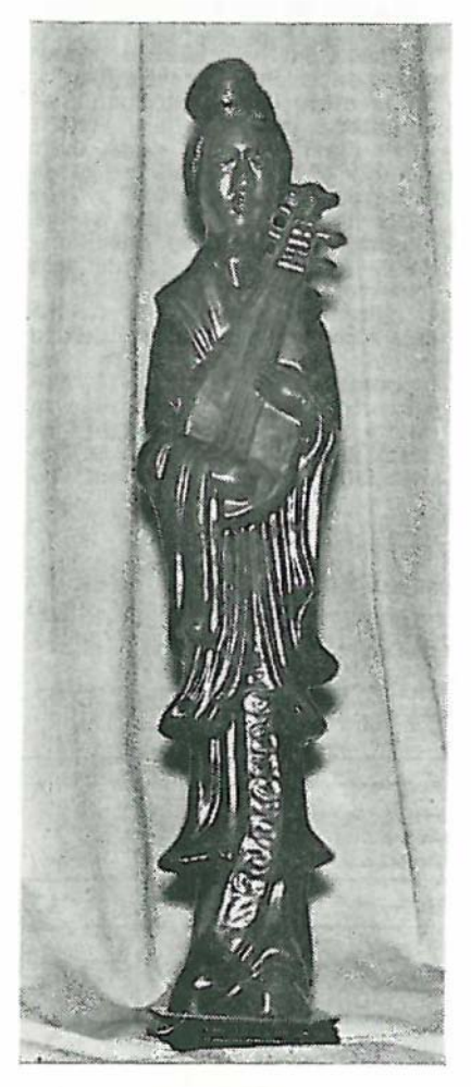
It may look like an ivory carving but in fact it is an example of the craft of the candlemaker.

In this case the miniatures are intricately carved wax candles depicting famous musicians such as Mozart and Bacthoven; legendary Chinese deities and even children's characters.